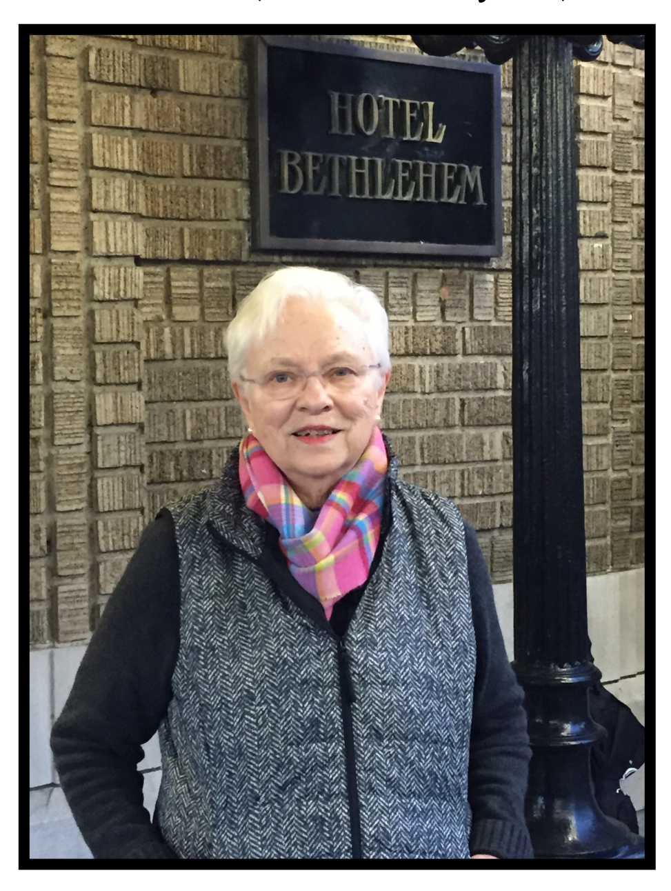
July 18, 2020 St. John's Lutheran Church Summit, New Jersey